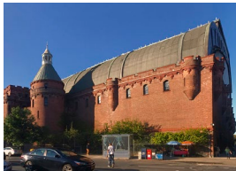
Kingsbridge Armory Bronx Emergency food packaging and delivery hub