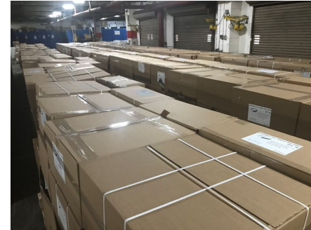
Above: Boxed face shields delivered to DCAS warehouse; Below: Gowns prepped for delivery