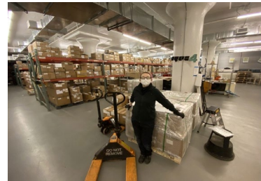
Workers producing face shields at Adafruit