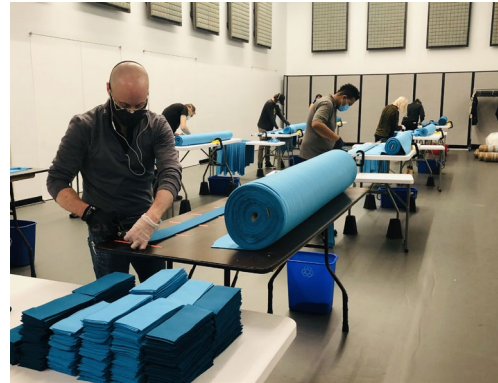
Gowns being manufactured through Open Jar Studios