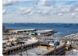
South Brooklyn Marine Terminal Brooklyn Providing parking for ambulances