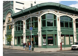
Audubon Ballroom Manhattan Support to Columbia University Medical Center/ NY Presbyterian