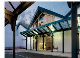
Cruise Terminal Brooklyn Medical facility to serve up to 750 NYC patients